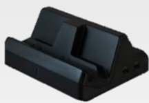
Desktop Dock USB2.0 x 4/RJ45 x 1/VGA x 1/HDMI x 1