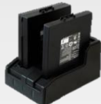
Dual-Bay Battery Charger