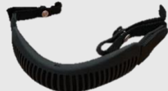
Top Carry Handle